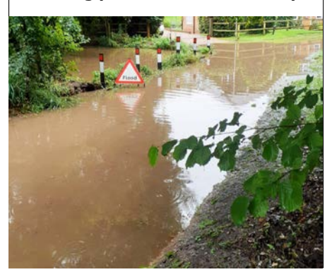
Photo taken 36 hours later following overnight rain illustrates how the balancing pond on its own can't cope.

The 'pond' should work in conjuction with the system of deep grips over a half-mile stretch higher up the road – which also need digging out and regular maintenance.